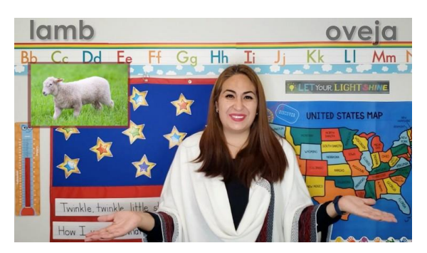
Circle Time at Home